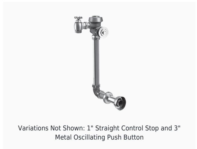
Variations Not Shown: 1" Straight Control Stop and 3" Metal Oscillating Push Button